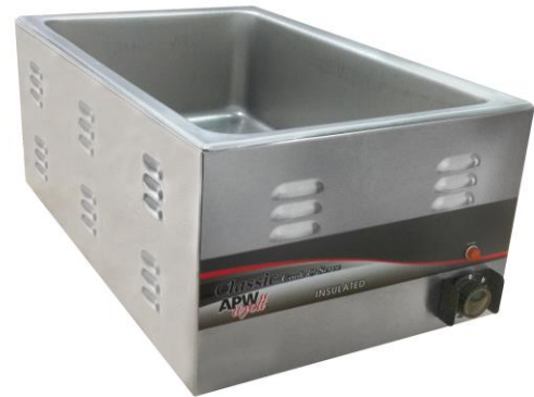
Model CW-2Ai Classic Cook & Serve