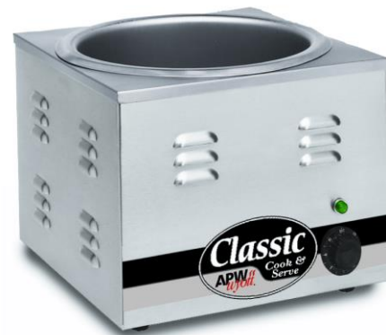
Model CW-1B Classic Cook & Serve