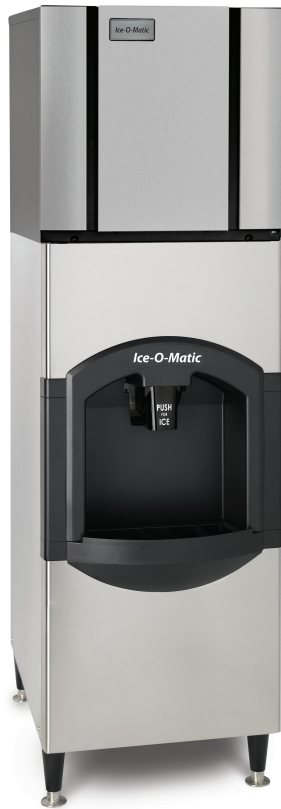
CD40022 WITH CIMO320