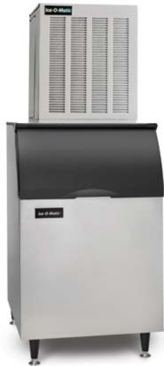
MFI1256 ON B55

MFI Series modular Flake ice machines feature the benefits of our SystemSafe load-monitoring control board that continually checks the workload on the gearbox. Additionally, the durable stainless steel evaporator, auger and in-line direct-drive train help reduce breakdowns.