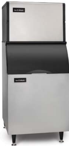
ICE0500 ON B55

Ice-O-Matic modular cubers are designed to provide the highest reliability, with carefree operation and maintenance. They produce pure, crystal clear ice for the most demanding foodservice and hospitality needs. Full and half cube configurations are available.