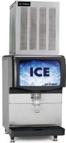
GEMO650 ON IOD200 DISPENSER

Our GEM Series modular Pearl Ice machines make the highly desired soft chewable ice that consumers love. They feature the benefits of decreased water and power usage compared to cube ice makers. Additionally, the stainless steel exterior construction, industry-leading in-line direct-drive technology and SystemSafe monitoring technology help reduce costly breakdowns.