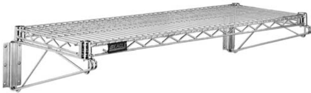
#GWB1436C wire wall shelf kit