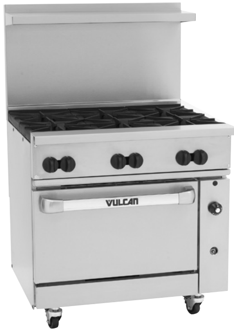
Model 36S-6BN (shown with optional casters)