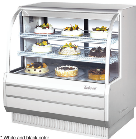
* White and black color come standard